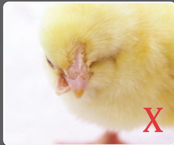
Cross beak/anatomical defects