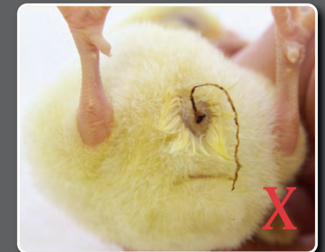
Large/long string navel