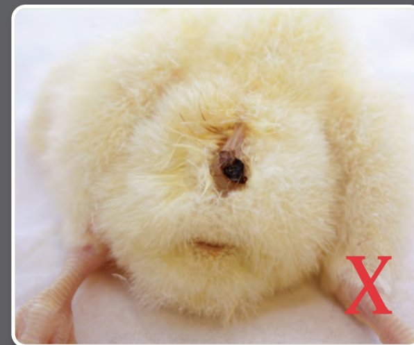
Large button navel