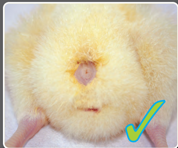
Well healed navel