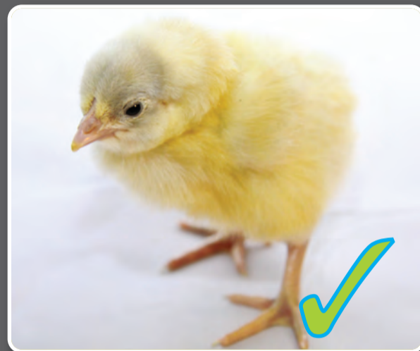
Light grey legs and feathers