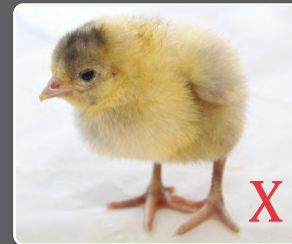
Majority dark grey/black