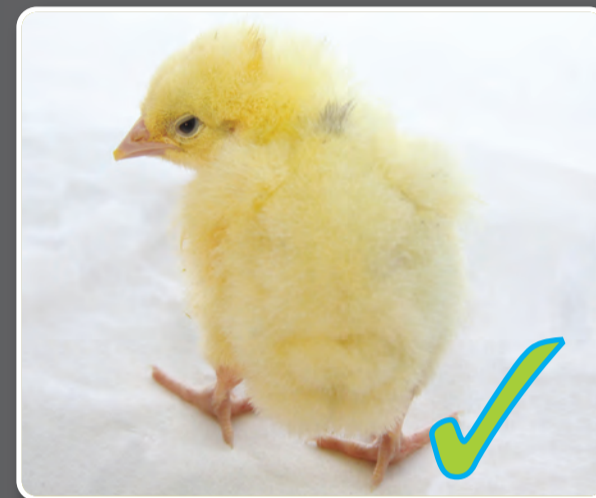
Small grey spot