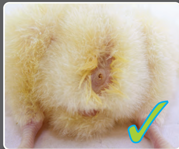
Healed navel with small string (string does not protrude above the chick down)