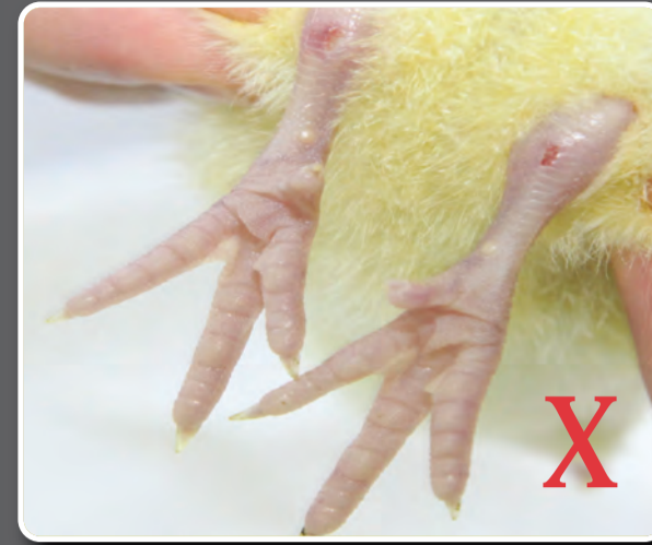
Open cut/abrasion on hocks