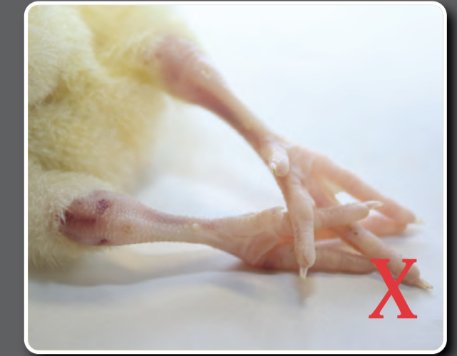
Damage to hocks